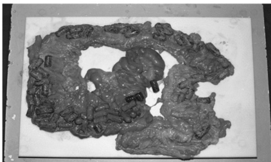
Fig. 1. Cocaine packs found in postmortem gastrointestinal tract especially in ileum and large intestine.