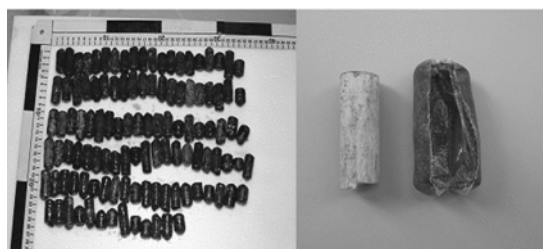
Fig. 2. Cocaine packs found in ileum and large intestine. Each size of these packs was about 1.5~4 cm of length and 1.5 cm of diameter (left). These were made with double layer of transparent film and black plastic bag (right).

body packer's postmortem specimen using GC/MS.