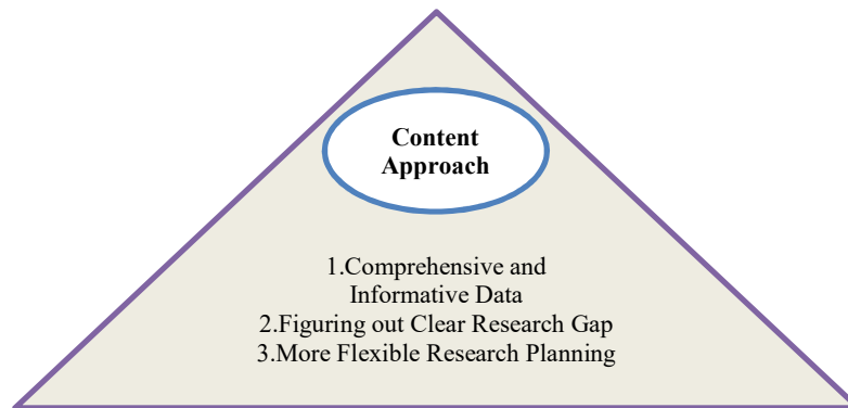
Figure 1: Key Advantage of Literature Content Approach

Measurement inaccuracy can be dealt with in several ways. Ex-ante skewness may be recognized, prevented, and reported using descriptive statistics and graphical approaches. Also, Expectations may be based on the relevance of a single component to the overall outcome. Researchers may use qualitative comparative analysis (QCA) to determine why certain items change and others don't. QCA can be utilized 10 to 50 times, depending on the type of investigation. CDKN helps developing countries. The CDKN M&E team used a quantitative, case-based technique to analyze research uptake (QCA). For example, QCA may be used to detect patterns in various situations (Lee, 2021).