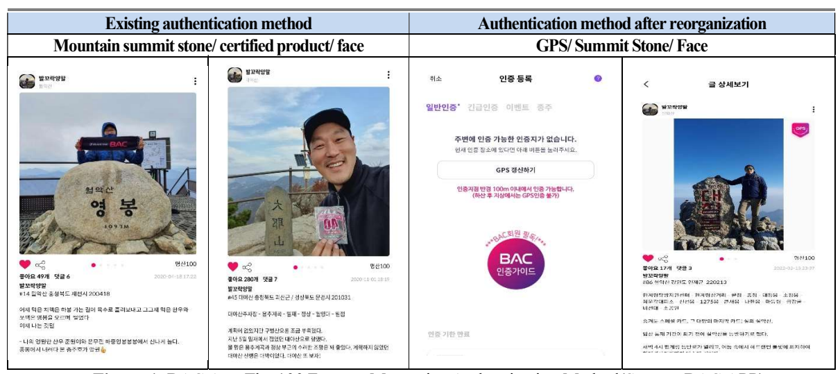
Figure 1: BAC App The 100 Famous Mountains Authentication Method

If the existing authentication method was an individual authentication method by administrators specified as Sherpa, the method using GPS has become a more convenient authentication method by utilizing OCR technology.