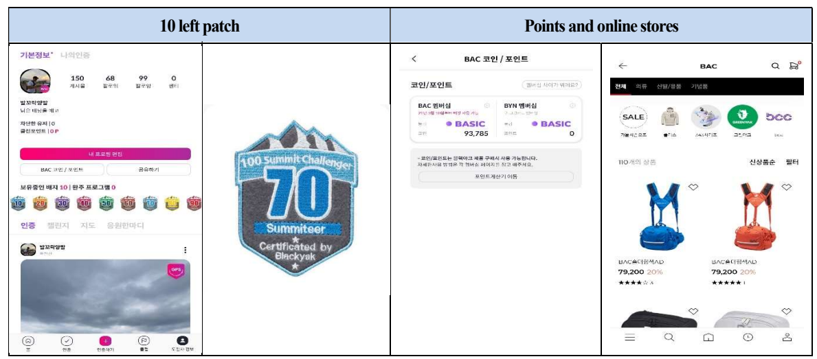
Figure 2: Patch and BAC Points Screen