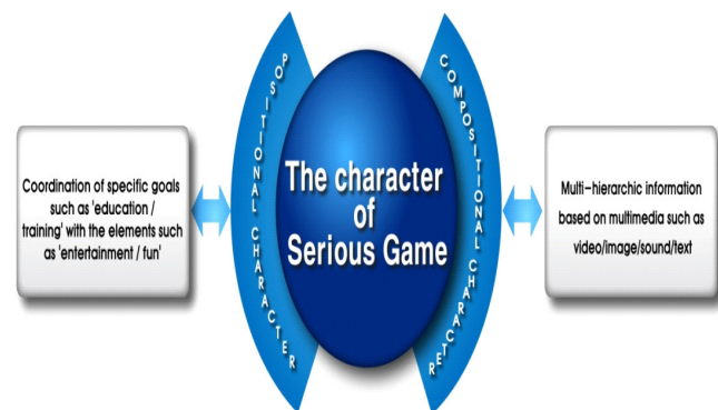
Fig. 1. The character of serious game

In Korea, various agencies and companies such as Korea Game Industry Agency, NHN, NC Soft, Soft Max, and HanbitSoft etc. have been developing serious games, and the Ministry of Culture, Sports & Tourism has launched a forum for serious games in July of 2008. Also, from this year, subjects applied to game will be formed in elementary and secondary schools' curriculum.[5]