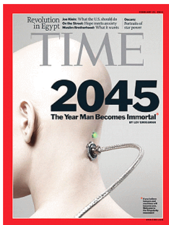
Fig. 1. The illustration of TIME's cover story

In the Feb. 21st edition of TIME magazine, its cover story, provocatively titled "2045: The Year Man Becomes Immortal", charged at the issue of immortality, though the illustration for the story seems to take on too much of Matrix-like punching-in-the-back-of-the-neck brain-connecting device. Mainly focusing on Ray Kurzweil's work on 'Singularity' explicated in his mind-boggling book, "The Singularity is near"[5], the story packs people in the theater of immortality, which our technological advancement may embody in the future system, whether it is mechanical, biochemical, or purely software-engineered.