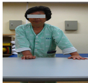
Fig. 4-2. Standing(Rt)