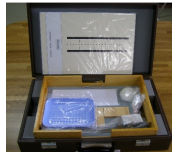
Fig. 5. Manual function test

implemented. Therefore, a perfect score is 32 points and the total score is the total of the points given to all the items [23]. Manual function scores (MFS) scores were obtained by converting the MFT scores on the basis of a full score of 100 points. The upper extremity function tests were conducted once before performing the exercises and again six weeks after performing the exercises.