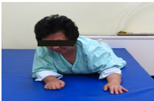
Fig. 1-1. Prone on elbow (Rt)