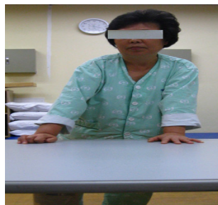
Fig. 4-1. Standing(Lt)