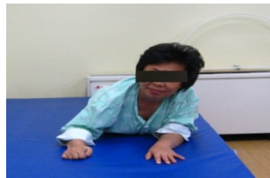
Fig. 1-2. Prone on elbow (Lt)