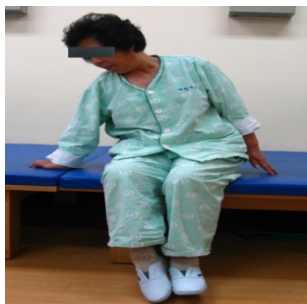
Fig. 3-1. Sitting pre-position