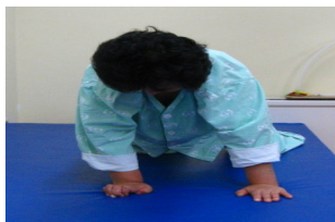
Fig. 2-1. Quadruped (Rt)