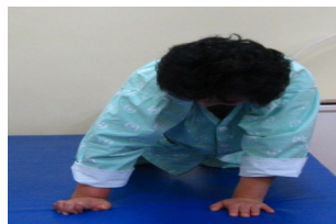
Fig. 2-2. Quadruped (Lt)