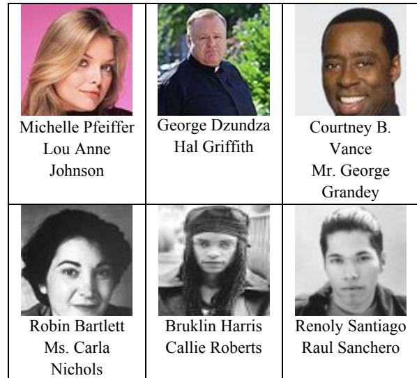
Fig. 2. Casting members of the movie

of promoting his confidence and self-respect. Emilio is the most troublesome student in the class and his life is jeopardized due to a personal relationship with a recently-released thug. She tries to protect him, but owing to the cold attitude of the principal, he cannot get help at the critical moment and is finally killed [17], [18].