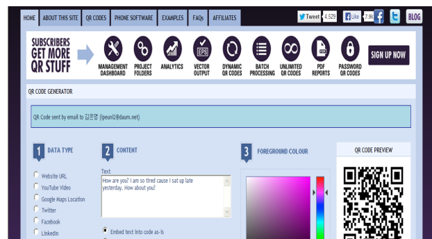
Fig. 1. Website 'QR stuff' for Generating QR Codes

The purpose of this activity is to make sentences in English and insert them in a QR code. The first step is selecting the data type at '1. DATA TYPE' in the left-hand side of the screen. Then, in the box of '2. CONTENT', type sentences to be inserted in the QR code. Here, the teacher can decide on the theme of sentences that students write; in [Fig. 1], 'greeting' is selected for an example theme of sentences. If a student wants to link a homepage or blog, he/she can simply copy the website's address and paste it in the box of '2 CONTENT'. After selecting the color of the QR code in '3. FOREGROUND COLOUR', a QR code is created automatically and it can then be simply downloaded and used. As such, various writing assignments can be done through QR code generating website. Any writing tasks can be easily submitted to the teacher by printing a QR code on paper or tasks can be shared between students by sending QR codes to each other through e-mail, social networks, or text messages.