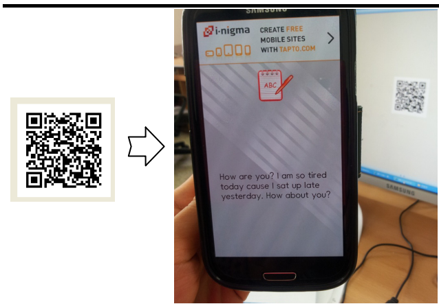
Fig. 2. Reading a QR Code Using Smart Phone