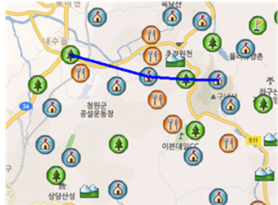
Fig. 3. POI trajectory of a user requesting a recommendation

moving patterns similar to those of a user who requests a recommendation through the comparison of attribute and trajectory similarities.