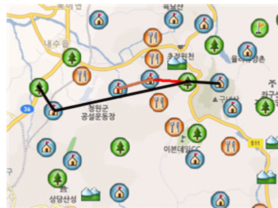
Fig. 4. POI trajectories of recommended users