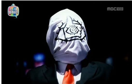
P3. Master wearing a white mask