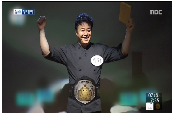
P1. A winner with the champion belt