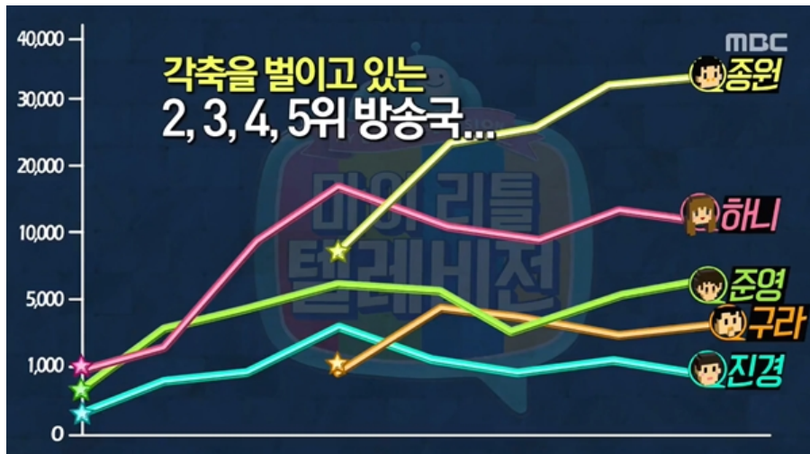
P 9. The live webcasting's viewer ratings announced in the network TV version.

Another strategy of the network TV version is maintaining tensions through facilitating the competition among the performers. Although performers and audiences already recognize about the competition, they often forget the fact while immersing themselves in the online chatting and performances. Thus, the competition becomes invisible in the live performance. However, on the screen of the network TV, the producers keep showing the viewer ratings graphs and Ms. MLT's announcements with notice subtitles (See picture 9). It is also effective to lead audiences to view the whole situation over each room rather than to focus on a particular room.