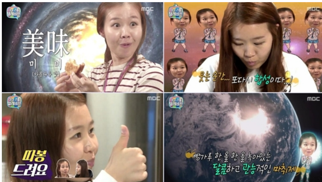
P 8. A taster's reaction with computer graphic images and texts

Unlike the live webcasting, the network TV editions tend to concentrate more on a particular interesting moment in each room rather than explaining the overall situation. To maximize the sense of fun at the interesting moment, the producers mobilize diverse cultural sources, visual