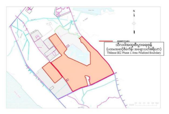
Figure 1 . SEZ typifications: Thilawa SEZ Phase 1 Area map.

We will now turn to the case of Thilawa SEZ to further elaborate the concept of territorialization . Integrating the official OECD's definition, a SEZ can be described as a locale ,