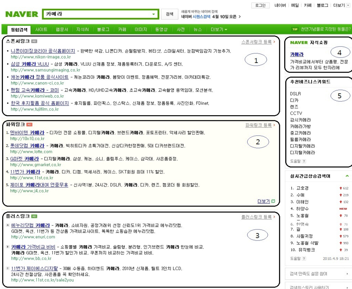
<Fig. 1> Naver Results for 'Camera'

Keyword advertising refers to a target advertising technique using a subscription-based service provided by a search engine so that the screen carrying search results may expose the advertisements of relevant companies to customers when they enter a search word into a search engine. This keyword advertising with a high clickthrough rate (CTR) is considered effective when compared to the low cost of advertising because it exposes advertisements to netizens only when they input a desired keyword into a search engine, and it shows