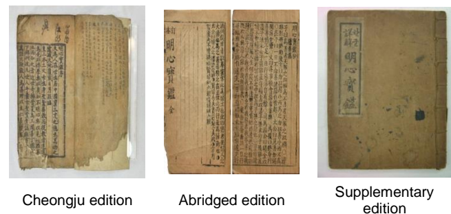
Figure 1: Myongsimbogam of Cheongju edition, Abridged edition, Supplementary edition

That is why it has been thought that Chujeok had compiled Myongsimbogam during the time it was being disseminated in Korea(Joseon). In the 1860s, when ChusSeMoon in Daegu published Myongsimbogam, he asked for a preface from Gimposusa Heofu, who attributed the work to Chujeok. Subsequently, the preface and postscript of the Damyang edition established the notion that Chujeok had compiled Myongsimbogam. As a result, the Chosunmyongsin, Donggukmunheonbigo, Damyangeupji, etc., all name Chujeok as the compiler.