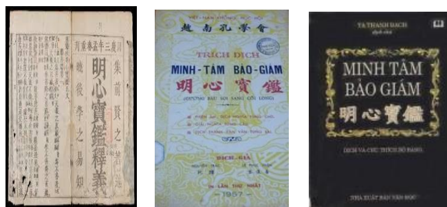
Published in Vietnam in 1888 Myongsimbogam Shi Yi

In Vietnam, the Myongsimbogam published in 1998. In this version, each sentence is interpreted and rendered phonetically in Vietnamese(Figure 3). In Vietnam, this book was used as an important textbook for cultivating individual morality and promoting the good customs of society.