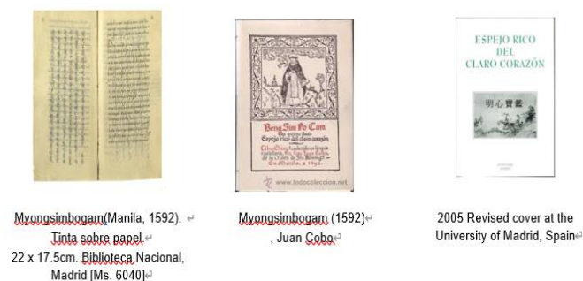
Figure 4: Myongsimbogam translated into Spanish