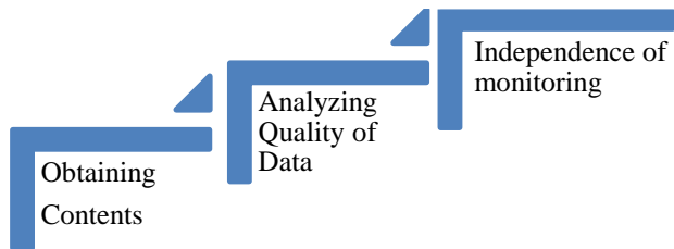
Figure 1: Step Up Process of Qualitative Textual Analysis