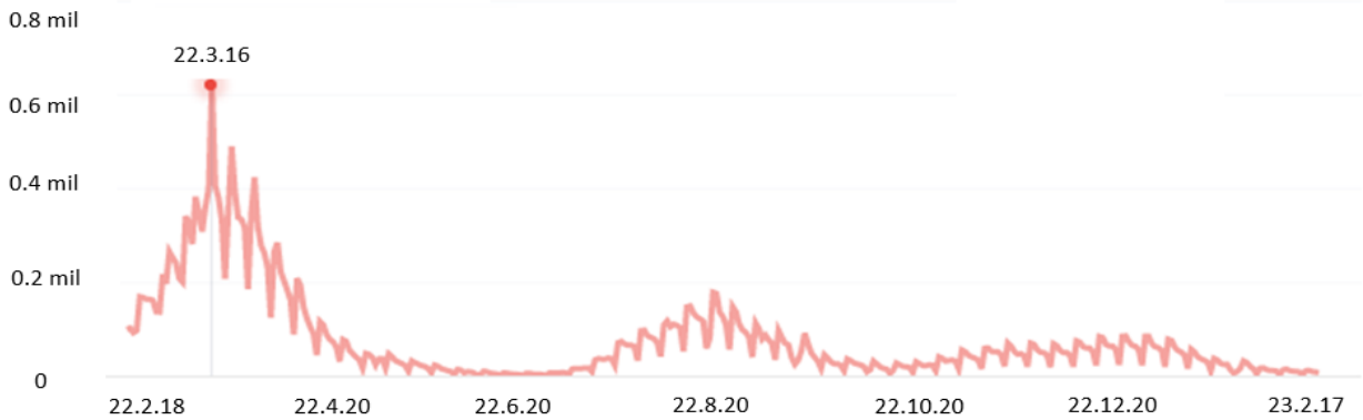
Figure 1: Trend of COVID-19 Confirmed Patients (revised from source: https://ncov.kdca.go.kr/ )

Accidents at industrial workplaces are constantly making headlines. In an effort to prevent tragic events like the humidifier disinfectant disaster and the Sewol ferry disaster from happening again and leaving a lasting impact on society, our community has been working to establish robust legal and institutional protections. The culmination of these efforts came with the enactment of the Serious Accident Punishment Act in January 2021, which was enforced starting January 27, 2022. However, despite these measures, incidents and accidents at industrial sites have continued to occur one after another, with construction sites struggling to adhere to the law (Giddens, 1999).