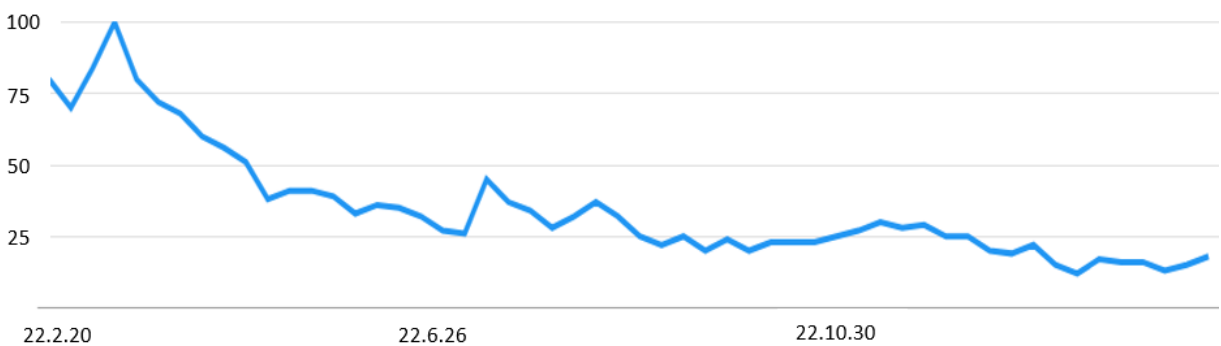
Figure 2: COVID-19 Google Trend in recent two years