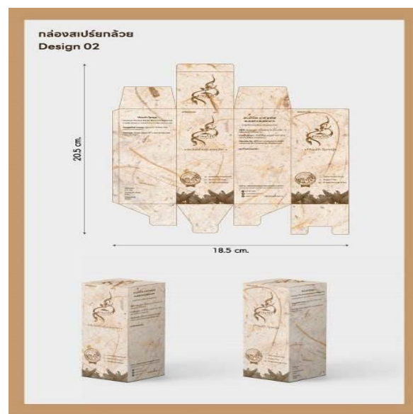
Figure 5: Pattern and packaging prototype for a banana throat spray box (source: created by authors)

3.3.2. Banana throat spray the outer packaging is a banana spray box for easy distribution.