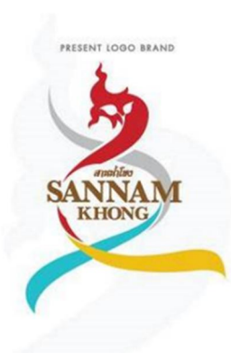
Figure 2: Emblem of “Ban Khok Kluai Hom Thong Community Enterprise Group” developed

The logo for the "Ban Khok Kluay Hom Thong