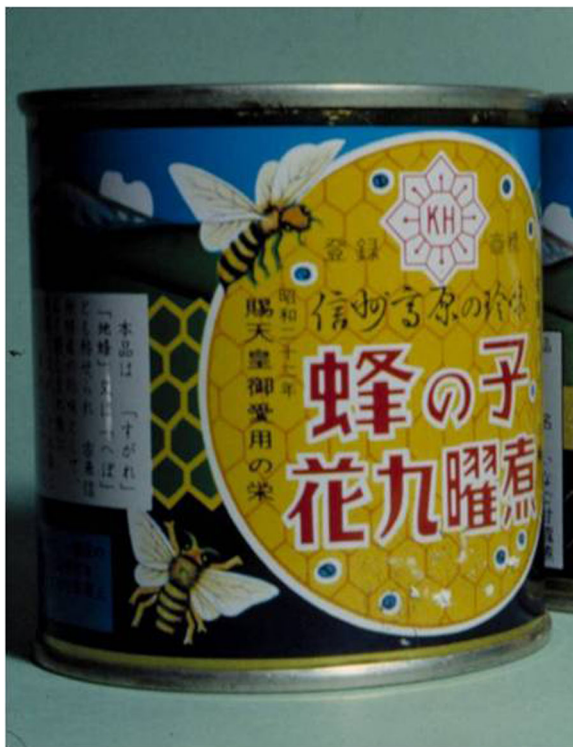
Fig. 3 Canned edible insects in Japan, sold under the name “hachinoko,” meaning bee larvae, although the product actually consists of wasp larvae.

A song sung by the Apatani of North-East India (Fig. 4) to their children as a lullaby in their language is Taiyan yang yangtaiyan yang yang. The lyrics are