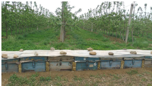
Fig. 5 At North Korea’s Taedonggang Fruit farm more than 3,400,000 apple trees are grown on an area of 1026 ha. To pollinate the apple flowers up to 3000 portable, wooden-framed beehives (with approximately 20,000 bees per colony), controlled by 100 beekeepers, are distributed around the farm.