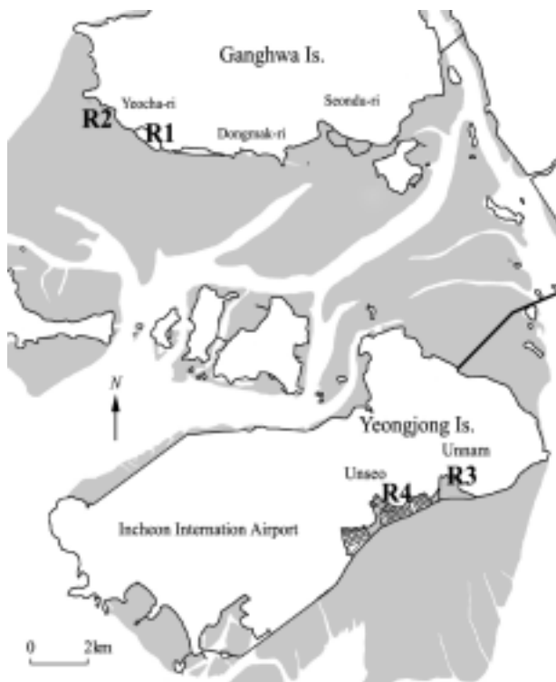
Fig. 1. Roosting sites of shorebirds on Ganghwa and Yeongjong Islands, near the West Coast of South Korea. The four roosting habitat types were: fishpond (R1), upper tidal zone (R2), salt marsh (R3) and saltpan (R4). Shaded areas indicate the flat zone at low tide.

A roost is a place where birds rest or sleep. Shorebirds use their roosts during high tides. Neap-tide roosts of shorebirds were on upper tidal zones, but spring-tide roosts were distributed in coastal wetlands such as drained fishponds, rice fields, and salt pans. Observations were conducted at two roosts in Ganghwa Island and two roosts in Yeongjong Island (Fig. 1). Habitat types at these four roosts were as follows: fishpond, upper tidal zone, salt marsh and saltpan. The upper tidal zone used as a neap-tide roosting area was in the Yeocha-ri mudflat of southwestern Ganghwa Island. The fishpond (46.9 ha) was located near the upper flat zone in Yeocha-ri, southern Ganghwa Island. The salt marsh (71.3 ha) in Unnam of southern Yeongjong Island was a mudflat enclosed by banks with sluices. The active salt pans (40.1 ha) were adjacent to the salt marsh. The fishpond and salt pans were used by shorebirds as traditional spring-tide roosts during the study period.