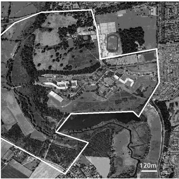
Fig. 1. Study area in woodland, Earham park and University of East Anglia (UEA).