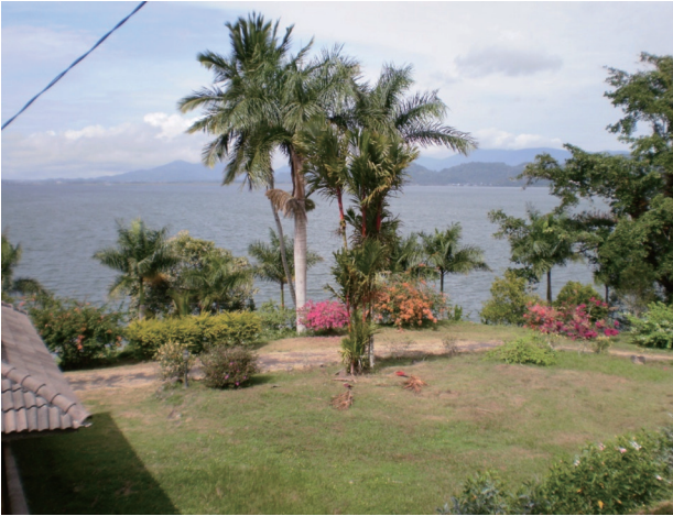
Fig. 2. Exotic species (Bougainvillea, palm, etc.) as ornamental plants in a tourist lodge.

Roystonea regia , Duranta erecta , and Pachystachys lutea (Fig. 2).