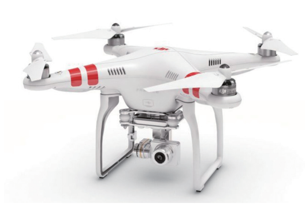
Fig. 1. External appearance of the aircraft Phantom 2 Vision + (DJI 2014).

When it comes to collecting ecological data, the drones are equipped with optical sensors (infrared and/or ultraviolet light included), physical sensors (temperature, pressure, humidity and conductivity), acoustic sensors (mainly for underwater use but can be used on land as