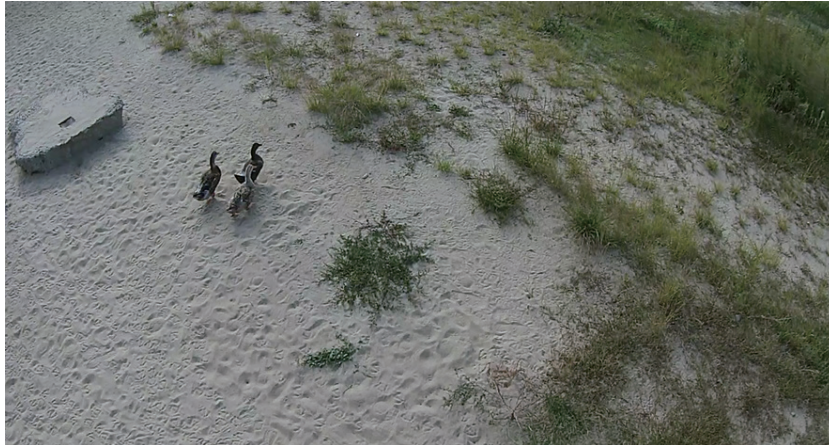
Fig. 5. The animals that live underneath the drone's flight remain undisturbed, and yet researchers are still able to record data.

park's total area is around 326 km 2 , and ranges across Taean-gun and Boryeong-si. There are 72 islands scattered across the calm sea of which only four are inhabited by people. The name "Taean (big comfort)" comes from the fact that the region did not suffer big natural catastrophes throughout history, and coupled with the mild climate and an abundance of food, it made for a non-weary life. As the only marine park in Korea where various coastal systems coexist, there is a great value in preserving the Taeanhaean National Park. The park is home to 1,195 animal species, 774 plant species, and 671 marine species. There are also 17 endangered species including Swinhoe's egret, the Korean golden frog, and the otter. There are also protected natural treasures such as the Mandarin duck, common kestrel, and osprey (Korea National Park Service 2009b).