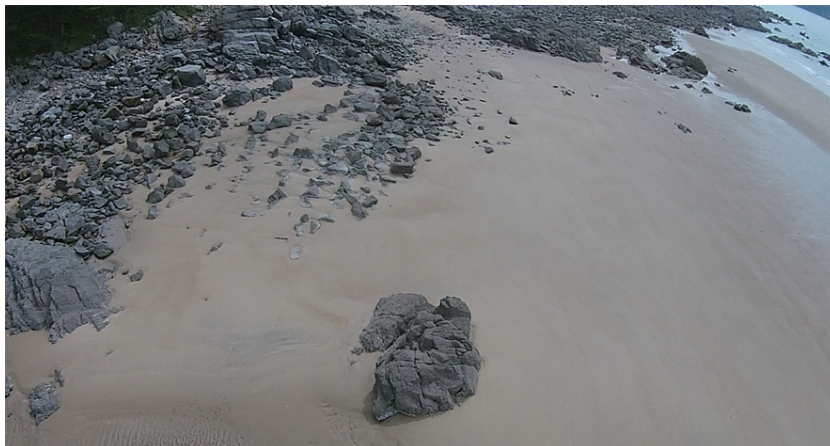
Fig. 4. Coastal areas remain untouched as the drone flies over them to record the land and species that live there.

category B safety zone. The update will also prevent the drone from setting up the waypoints within 8 km of safety zones. The map showing waypoints safety areas can be found on the webpage dji.com/fly-safe (DJI 2014a).