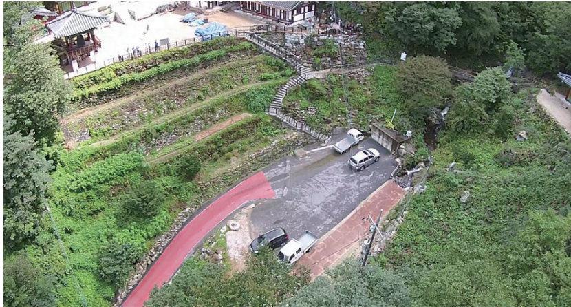
Fig. 3. Example of the drone using its high definition camera to monitor land from above.