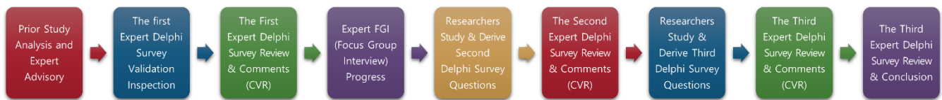
Figure 2: Process of Delphi Survey

content validity was based on the Likert 5-points scale, and when the appropriateness was 2-points or less, the questionnaire was conducted to write the basis for the response on the evaluation scale. The order of the Delphi investigation was carried out as shown in Figure 2. First, for the first Delphi survey, the first survey paper prepared through domestic and foreign research, literature research and expert advice was prepared. The Delphi first survey included all the traditionally treated contents of the three components, narrowed the scope according to the purpose of this course, but focused on elaborating in consideration of the connection between the three components. In the second Delphi survey, Table 2 provides examples of data analysis and AI application problem solving in consideration of the evaluation of content areas/elements modified by reflecting the first Delphi opinion, and review of the composition between items, and industry prospects related to business sectors. In order to carry out the proposed problem solving example, a questionnaire was conducted with the sub-elements of the educational content to be dealt with in the data analysis component and the packages to be dealt with.