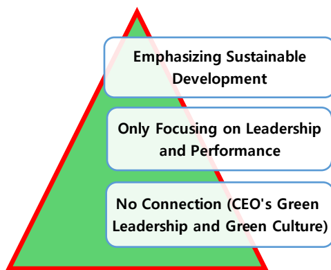
Figure 1: Research Gap of the Study

in the contemporary world. The relationship emphasized in the literature is the connection between sustainable development and organizational performance. After defining the relationship between sustainable leadership and organizational learning, organizational learning has been linked with many merits like organizational performance increase, sustainable performance, and both financially, socially, and environmentally. The previous studies focus on the impact of sustainable leadership on the sustainable performance of the entire organization. The above extent literature defines a gap in defining the relationship between sustainable leadership and the sustainable performance of different stakeholders like employees. This research addresses the above gap by defining the importance of the CEO's sustainable leadership to distribute environmental education culture to improve employees' environmental performance.