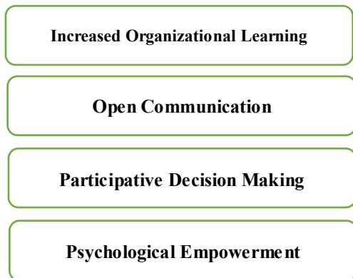
Figure 3: Four Solutions