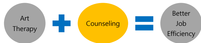
Figure 1: Research Aim of This Study

There is little emphasis on alternative forms of communication in psychotherapy, thus leaving a gap in research on the impact and effects of alternatives such as using artistic expressions. This paper, therefore, seeks to address the gap by investigating the effect of psychological counseling using Art Therapy on improving workers' job efficiency. Essentially, the research aims to describe Art therapy and its impact on improving employees' job efficiency. Art therapy enables a detailed and accurate understanding and analysis of the client's emotions and expressions, thus facilitating correct counseling and mitigating mental health challenges.