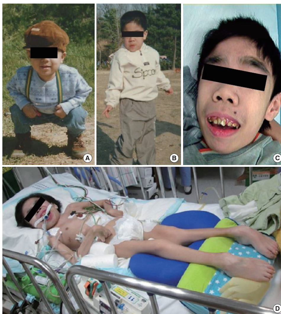
Fig. 1. Serial photographs of a patient with MPS IIIB. (A) Mild facial coarseness was noted at the age of 4 years. Facial dysmorphism, including coarse facial features, a depressed nasal bridge, prominent eyebrows, and malocclusion, was apparent at the ages of (B) 13 and (C) 18 years. (D) He was bedridden and malnourished at the age of 21 years.

There is still no definitive treatment for the CNS symptoms of MPS III. The most difficult problem in treating neurological symptoms in MPS III patients is getting the drug into the brain, in other words, overcoming the blood brain barrier (BBB). Extensive research is being carried out on this problem.