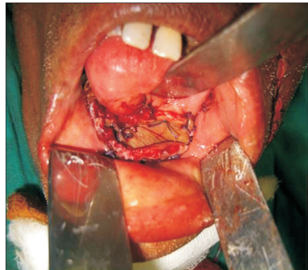
Fig. 5. Wide excision of the lesion with hemimandibulectomy was completed. Saba Khan et al: Adenoid cystic carcinoma presenting as an ulcer on the floor of the mouth: a rare case report. J Korean Assoc Oral Maxillofac Surg 2014

tissue was found adjacent to the connective tissue. Based on the clinical features and the histopathologic report, a final diagnosis of adenoid cystic carcinoma T4aN0M0 was made.(Fig. 4) Wide excision of the lesion with hemimandibulectomy was completed.(Fig. 5) The patient was then referred for further radiotherapy.