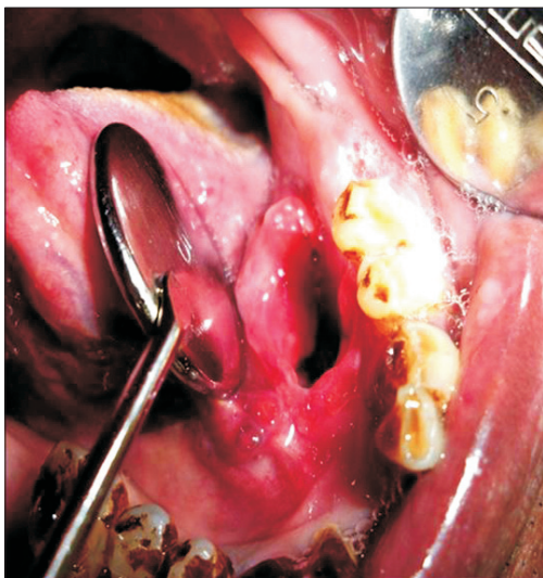
Fig. 1. Solitary ulcer on the floor of the mouth. Saba Khan et al: Adenoid cystic carcinoma presenting as an ulcer on the floor of the mouth: a rare case report. J Korean Assoc Oral Maxillofac Surg 2014

Based on the history given by the patient and the clinical features, a provisional diagnosis of carcinoma of the floor of the mouth T4aN0M0, chronic generalized periodontitis, partially edentulous in respect to tooth #7, #5, #3, #13, #14, #15, #24, #19, #25, and #31 was made. Lesions presenting as solitary ulcers on the floor of the mouth were considered in the differential diagnosis. Traumatic ulcers are most common on the tongue, lips, mucobuccal fold, gingiva and palate. They present as solitary ulcers with raised reddish borders and white necrotic floors with associated history of trauma. On the floor of the mouth, they are usually due to calculus or sharp denture margins. Major recurrent aphthous ulcers are