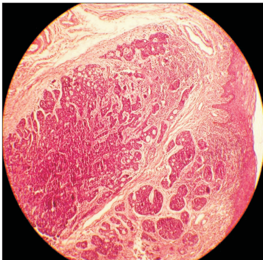
Fig. 4. Presence of uniform basaloid cells arranged in the form of solid islands (H&E staining, \times 40 ). Saba Khan et al: Adenoid cystic carcinoma presenting as an ulcer on the floor of the mouth: a rare case report. J Korean Assoc Oral Maxillofac Surg 2014