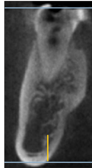
Fig. 3. Blue line (below) is parallel to occlusal plane. Yellow line is perpendicular to blue line. Lengths of yellow line is lengths between canal and inferior cortical bone.

Next, the values were compared at the first molar. First, the distance between the buccal margin of the canal and the buccal cortical margin was compared between both groups. The means were 0.59 cm in Group I and 0.68 cm in Group II. A statistically significant difference was seen with a P -value of 0.024. (Table 1) The mandibular thickness was 1.07 cm in Group I and 1.20 cm in Group II ( P=0.003 ). (Table 2) Next, the buccolingual position of the buccal margin of the canal was compared between the two groups. In Group I and Group II, the mean values were 55 and 57, respectively. The P -value was 0.184 when Student's t-test was performed, and no statistically significant difference was noted. (Table 3) Next,