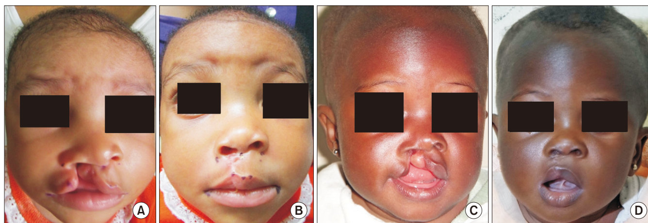
Fig. 1. A 4-month-old female with right unilateral cleft lip and alveolus, preoperative picture (A) and postoperative picture (B) showing a repair with the Millard technique that the guardian judged to be satisfactory. A 4-month-old female with right unilateral cleft lip alveolus and palate, preoperative picture (C) and postoperative picture (D) showing a repair with the Tennison–Randall technique that the guardian judged to be satisfactory.

There is consensus that Millard cleft lip repair produces better nasal symmetry than TR repair 19,25 . However, we found significantly more symmetrical noses in TR than in Millard repair subjects. This might be due to other factors not explored like width of the cleft and the skill of the surgeon 19 .