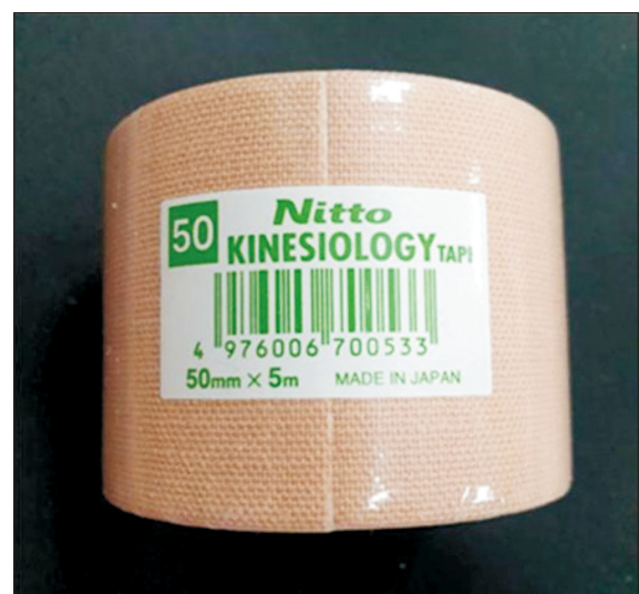
Fig. 1. Skin-colored Nitto Kinesiology Tape (5 cm×5 m; Nitto Denko Group).

An ice pack was applied for 6 hours after surgery in all pa-