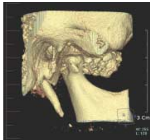
Fig. 2. multiple calcification in cone beam CT.