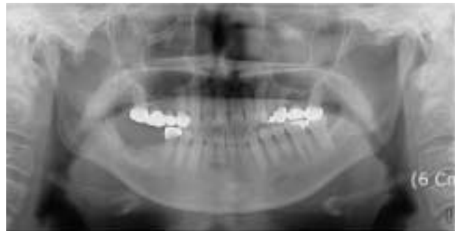
Fig. 1. multiple radiopaque mass at Rt. Condyle head.

In fact, she was a patient who had a squamous cell carcinoma on her Mandible. So, we had to operate on marginal mandibulectomy under general anesthesia. After marginal