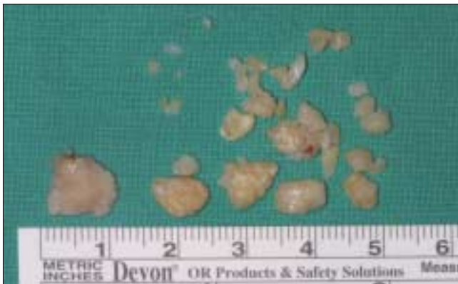
Fig. 3. removed calcified mass.