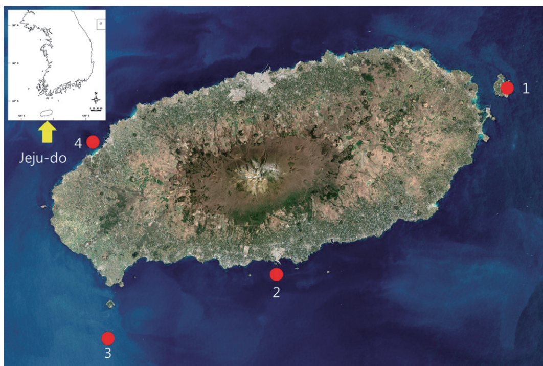
Fig. 1. A map of Jeju-do (Jeju Island) with detailed position of collection sites of samples studied samples. 1. Udo Island. 2. Munseom Island. 3. Marado Island. 4. Biyangdo Island.

gwipo-si, Jeju-do), 20-30 m depth (Fig. 1). All specimens were growing on rock.