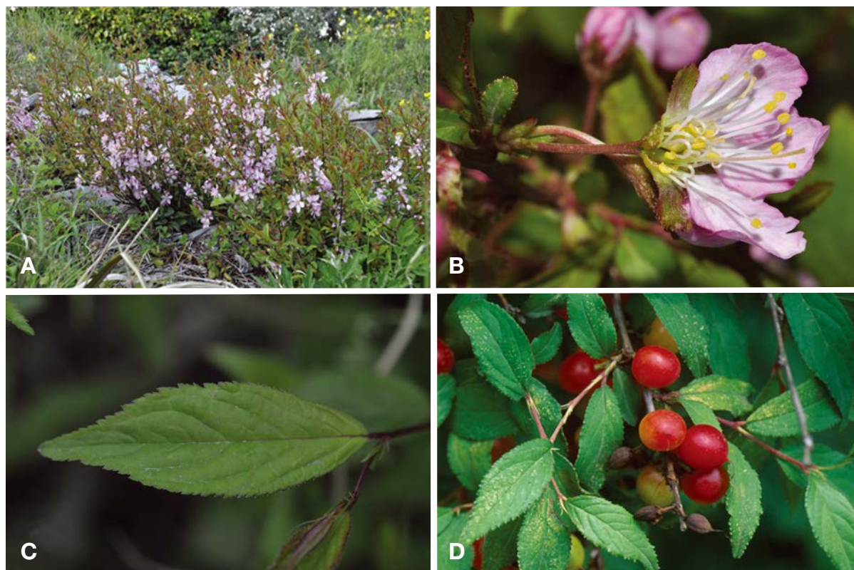
Fig. 1. Photographs of Prunus glandulosa Thunb. A. Habitat; B. Flower; C. Leaf blade adaxial surface; D. Fruit.