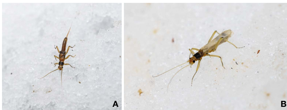
Fig. 3. Habitat of Mesyatsia makartchenkoi Teslenko & Zhiltzova, 1992: South Korea, Odaesan Mts. A. larva, walking on the snow; B. adult, walking on the ice.

and strongly sclerotized. Abdominal tergum 9 extended backwards laterally (Fig. 1D). Abdominal sternum 9 with small vesicle (Fig. 1F). Subgenital plate dark, large, strongly elongated, scoop-shaped, upcurved with tongue-shaped apex (Fig. 1E). Abdominal tergum 10 medially divided into two, hairy lobes posteriorly (Fig. 1D). Between these lobes are sclerotized finger-shaped processes of the basal plate of the epiproct positioned (Fig. 1D). Cercus five-segmented, blunt (Fig. 1D). Female adult. Abdominal sternum 8 with wide and dark pregenital plate and triangular vulvar sclerites (Fig. 2A). Postgenital plate of sternum 9 large, elongated, apex rounded subtriangular (Fig. 2B). Cerci with 6 segments.