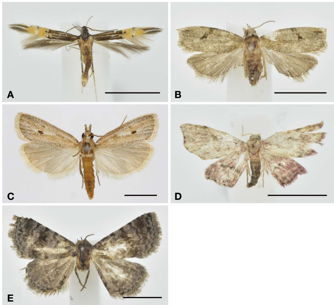
Fig. 1. Adult habitus. A. Cosmopterix flavidella Kuroko, 2011, male. B. Noduliferola abstrusa Kuznetsov, 1973, female. C. Maliarpha borealis Sasaki, 2012, male. D. Ectoblemma rosella Sugi, 1982, female. E. Metachrostis miasma (Hampson, 1891), male. Scale bars = 4 mm.