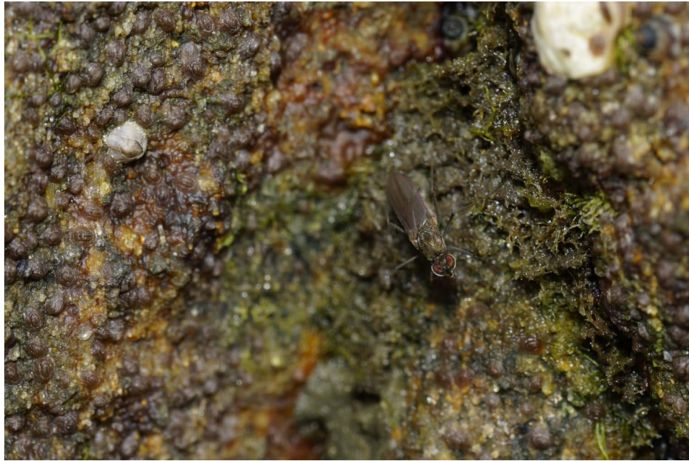
Fig. 1. Habitat of Acymatopus minor Takagi, 1965.