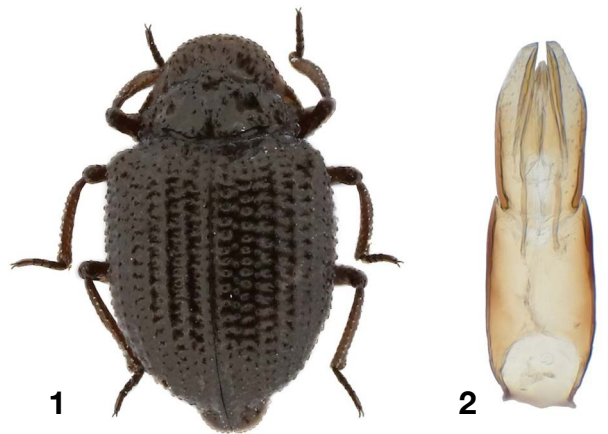
Figs. 1–2. Georissus kurosawai (Gorham, 1892): 1) habitus 1.8 mm, dorsal view; 2) aedeagus, dorsal view. Scale bar = 0.1 mm.

Diagnosis. Length 1.6–1.8 mm. Body oblong oval, convex dorso-ventrally, with granules. Color black, shining; legs dark brown; surface often covered with grey mud and sand (Fig. 1). Pronotal side dentate. Posterior parts of pronotum with granules, subbasal dentation, central depression and subbasal depression. Elytra with distinct granules. Elytral interstices raised. Sternite without ventral teeth. Median lobe as long as paramere; narrow apically; apical margin V-shaped. Paramere shorter than pallobase; lateral margin slightly rounded and widest at third (Fig. 2). Materials examined. KOREA: 30 exs, Nambuk-ri, Inje-eup, Inje-gun, Gangwon-do (38°4'34.24"N, 128°8'