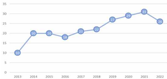
Figure 1: Publication Status of Research on University Unification Education by Year

papers in 2017, 22 papers in 2018, 27 papers in 2019, 29 papers in 2020, 31 papers in 2021, and 26 papers in 2022 [Figure 1].