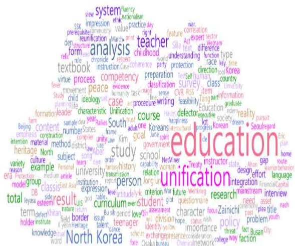
Figure 4: Word Cloud Using Frequency of Occurrence