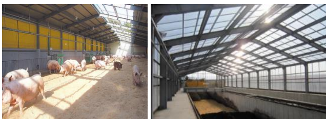
Figure 2: Winch Curtain Applied to the Pig Pen

The first problem to be solved is the sealing problem. This is because once the sealing problem is solved, the spreading odor can be controlled, and the rest of the problems can be solved through air conditioning and facilities. However, due to the above reasons, the construction of remodeling and changing to an airtight structure is not realistically suitable. Therefore, in this study, it is proposed to use a method of sealing using a winch curtain. The winch curtain can open and close depending on the inside and outside temperature. Due to this feature, it is easy to control the internal temperature. In addition, if installed meticulously, it can have a sealing effect that blocks the inside and outside. Figure 2 shows the appearance of a pig pen with a winch curtain applied.