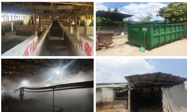
Figure 1: Pig Farm Problems

Figure 1 presents the scene where such a problem was revealed.