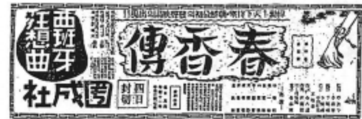
Fig. 3. Chunhyangjeon . Advertisement. Chosun Ilbo , October 4, 1935.

The Chunhyangjeon advertisement (as seen in figure 3) announced that the film was released at the Dansungsa Cinema on October 4, 1935. The headline reads: “A Great Story. . . . The World Has Been Waiting for This. . . . The Premiere of the First Korean Talkie.” The cast and crew are also listed. When Chunhyangjeon was released, audiences rushed to see it for novelty’s sake, which helped it to break box office records. The film became a sign that Korean sound productions could achieve success and recognition from local