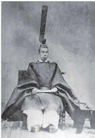
Figure 2. This is the Emperor in 1872 in full traditional regalia

In fact, the image of the Meiji Emperor underwent just such a modern transformation.