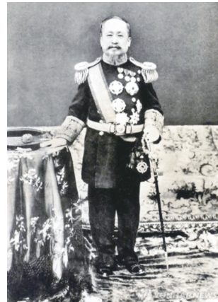
Figure 5. King Gojong as highly-decorated Field Marshal.