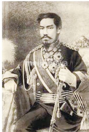
Figure 3. This is the same Emperor in 1873