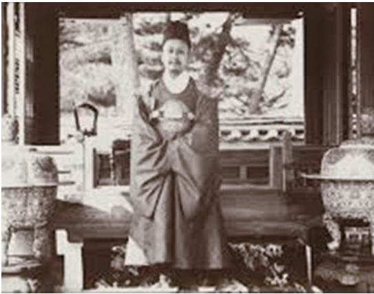
Figure 4. King Gojong. Confucian ruler in native garb

As the Joseon dynasty (1392–1897) came to a close and the (short) era of the Great Korean Empire (1897–1910) opened (at the urging of the Japanese), King Gojong follows the Japanese formula to the letter in his transformation from King to Emperor.