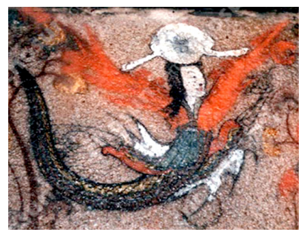
Figure 2. Dalsin (Moon Goddess), Ohoebun Tomb No. 4, Ji'an, China

are depicted flying into the sky while facing each other. Dalsin, holding the moon above her head, is depicted in the left corner of the first floor stylobate (Fig. 2), and Haesin, holding the sun above his head, is painted opposite in the right corner (Fig. 3). The moon in Dalsin's hands features a toad in its center, which likewise is a symbol of the moon, while the sun in Haesin's hands displays a three-legged crow, which equally is a symbol of the sun