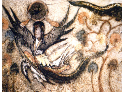
Figure 3. Haesin (Sun God), Ohoebun Tomb No. 4, Ji'an, China