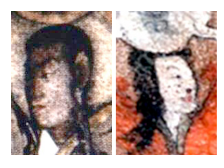
Figure 4. Faces of Haesin and Dalsin, Ohoebun Tomb No. 4, Ji'an, China

Art therapy, for example, uses this technique. The vitality of the faces comes from the painter's ability to draw images alive . This unifying moment of creation