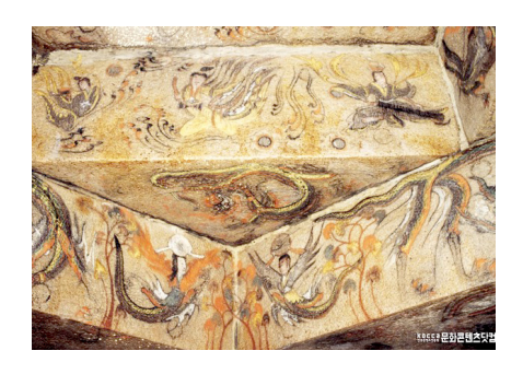
Figure 1. Mural paintings of one corner of Tomb No. 4 (6th–7th century) of the Ohoebun Goguryeo tombs, Ji'an, China

The tomb is decorated with a great variety of funeral art, but the paintings of the Sun God, Haesin, and the Moon Goddess, Dalsin, display extraordinarily vivid facial expressions. The images of Haesin and Dalsin are located on the north side of the tomb, and they