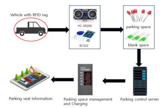
Figure 2 : Intelligence Parking Lot Control System Diagram

The system in this paper aims to effectively manage parking spaces and promote driver convenience by using various sensors such as RFID sensors and ultrasonic sensors based on Arduino. When parking, RFID distinguishes registered vehicle and external vehicle and a vacant seat is displayed by ultrasonic sensor. This enables the parking lot to be managed by a control system.