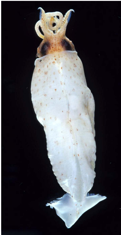
Fig. 2. Liocranchia reinhardtii Steenstrup