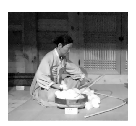
Figure 2. Wax Figure Using Sosageo (Carding Tools Including Bow and Reel 繅絲車), Cotton Museum, Sancheong, Gyeongsangbuk-do, Korea.

In this respect, I disagree with the established views referring to sosageo as a spinning wheel. As mentioned previously, Goryeo already had a rich tradition in silk, hemp, and linen weaving. These textiles required spinning wheels and expertise in their usage. Against this weaving tradition, it is inconceivable that the new invention named sosageo is a spinning wheel when the Goryeo household must have already been familiar with the wheel. Instead, I would