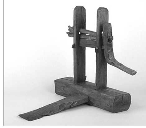
Figure 1. Cotton and Chijageo , 40 x 41, 43 cm, Samcheok silip bagmulgwan (Samcheok Municipal Museum 217), Gangwon-do, Korea.