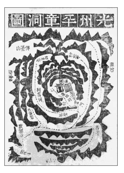
Figure 2 Geomantic Map of an Ancestral Graveyard by Geomancy of Tomb (Collection of the Seoul Museum of History)

Figure 1 Geomantic Map of the Situation of a Village by Geomancy of House (Collection of the Seoul Museum of History)