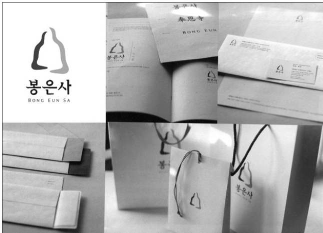
Figure 2. The new logo and examples of the graphic charter and signature established in Bongeunsa in 2008 (published on Bongeunsa’s website in 2008)

In addition to this rather systematized core of discourse, Bongeunsa