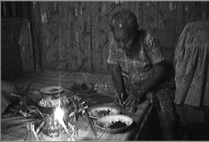
Plate 2. Ritual officiant feeding the twin-figure in the Tukajan ritual.