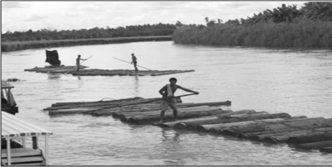
Plate 3. Logs floated downstream for the market